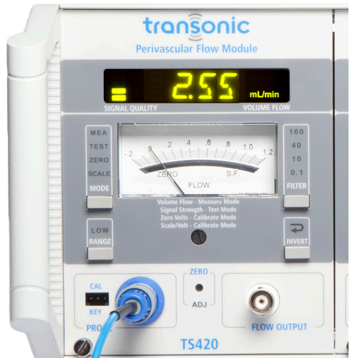
T403 Console with TS410 and TS420 Modules