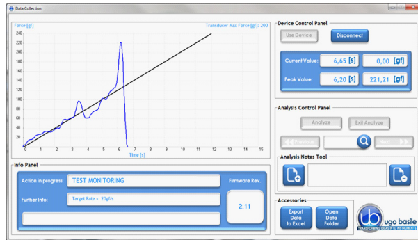
Figure 1: Screenshot of the GSM software showing the force trace (in red) and the desired target force rate (in blue) - slope function

Optional grids are available for integrated measurement of the four limbs (left) or hindlimbs (right)